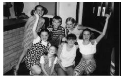
Hi-de-hi from the Deerlins kiddiwinks....

on 8th January for our first rehearsal of 'Most Happy Fella'. We're planning a Social Evening for new members at this rehearsal and we need as many as possible to support our next production. It's a different show to our recent offerings, and we rely on our current members to support us in keeping up the quality we're associated with.